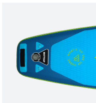
Ultra-comfortable EVA mat with kick pad on tail