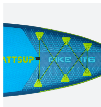
Practical storage: front loading straps