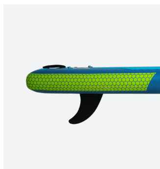
Gearing up : central spoiler for rapid acceleration

Its generous width and long, tapered nose give it excellent gliding performance, as well as unrivalled stiffness and stability. Its top-quality EVA coating is essential for good support when manoeuvring and in the waves.