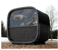
Half moon glazed