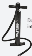
Double action inflation pump