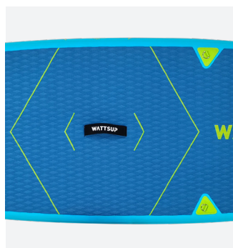
2 in 1 use: fastening and kayak chair included