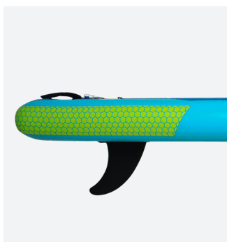
Perfect glide thanks to 3 fins (1 removable + 2 fixed)

This model is ideal for beginners and intermediates who want to progress quickly. As well as its innovative, futuristic design, it has a very comfortable EVA mat with a kick pad on the tail. This raised section at the rear provides perfect support for easy turns in the waves.