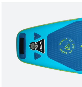
Ultra-comfortable EVA mat with kick pad on tail